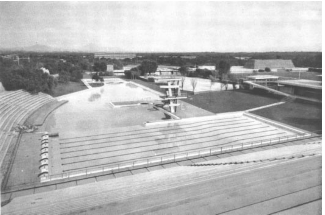
Swimming and diving pools at the University of Mexico for the II. Pan American Games (March 1955). With its handsomely landscaped surroundings, this is undoubtedly one of the most beautiful swimming installations to be seen. Dressing-rooms are under the stands in the foreground.