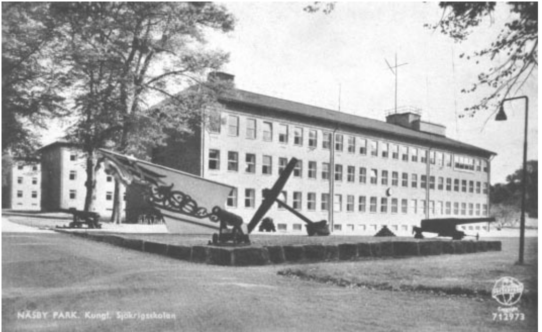
NAVAL COLLEGE, NASBY will serve as Olympic Village to the participants of the Olympic Equestrian Games, Stockholm 1956.