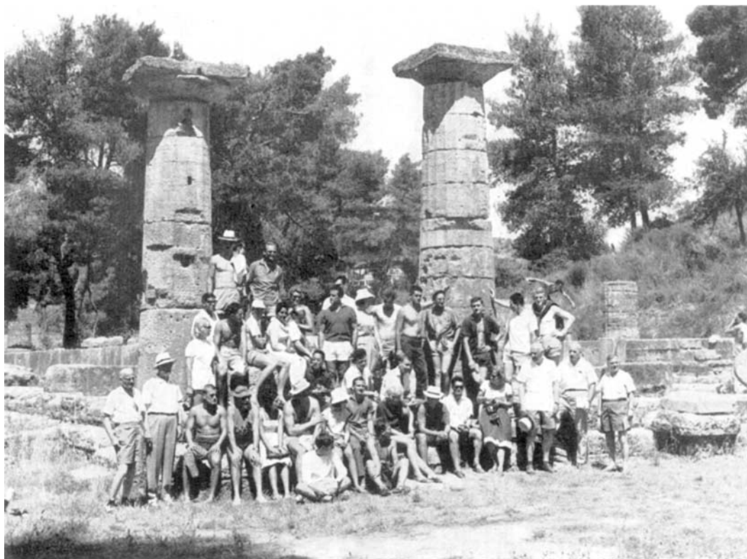
The participants of 23 nations.