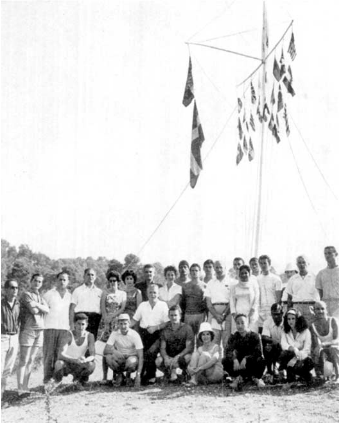
A group of participants.