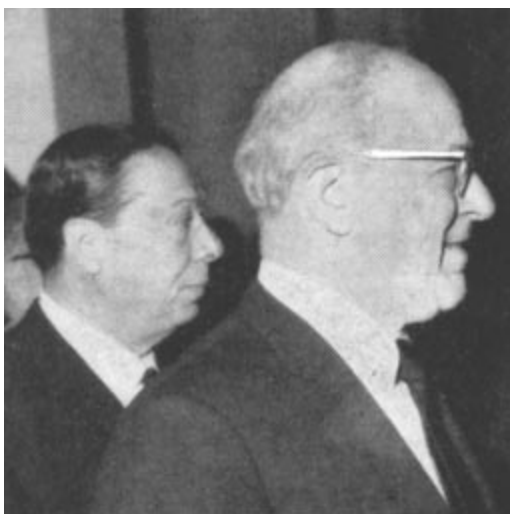
Giulio Onesti : "... the I.O.C. has had the good fortune to be guided by eminent and energetic men convinced by one faith alone."

The Italian National Olympic Committee has the honour of addressing a greeting of homage and welcome to the International Olympic Committee which has kindly conceded the privilege to the City of Rome of acting as host to the present Session, the 64th in number, of the modern Olympic movement.