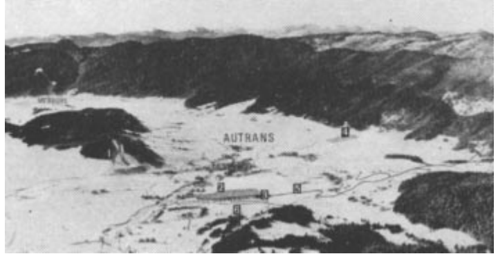
Autrans. Nordic events. 1 : 70 and 40 m. jumpfill ; 2 : olympic village ; 3 : stadium ; 4 : shooting range ; 5: start ; 6 : finish.

population with the ceremony. The Organizing Committee envisions the possibility of a capacity of 40 000 to 45 000 in the stadium with the aid of provisional arrangements now under study. The ceremony itself which is to take place there will be preceded by a parade of the different delegations through the Paul-Mistral Park, permitting an extremely large number of Grenoble inhabitants to participate in the celebration.