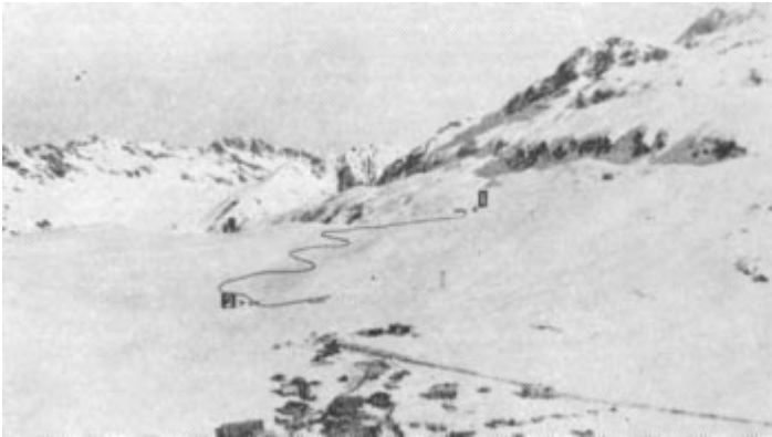
Alpe d'Huez. Bobsleigh run. 1 : start ; 2 : finish.