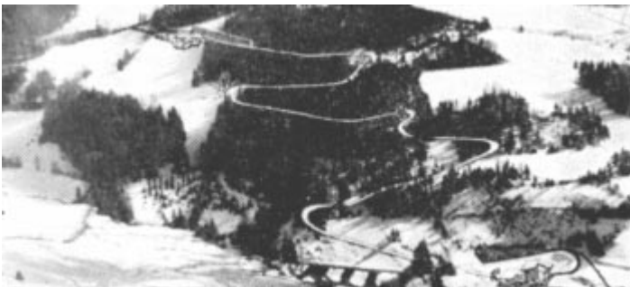
Villard-de-Lans. Luge run.