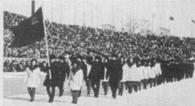
U. R. S. S. / U. S. S. R.