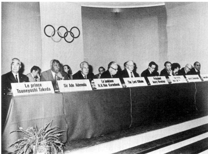
The Executive Board during its meeting with the representatives of the International Federations

On the occasion of the classic meeting of the Executive Board with the International Federations, scheduled every two years, many members of the International Olympic Committee were in Lausanne from 25th to 31st May, so as to take part in the various commission meetings, which we mentioned in the "Olympic Review", no. 53-54.