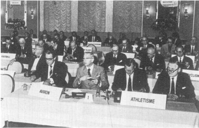
The representatives of the International Federations