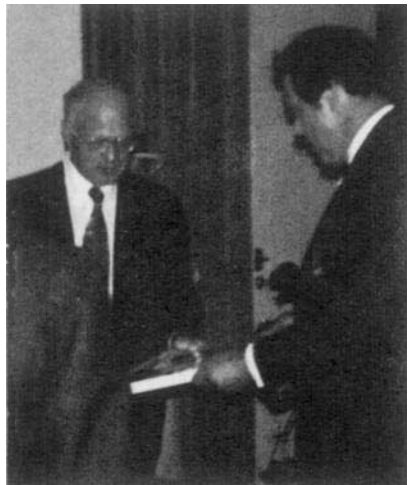
On behalf of the International Federations, Mr. Thomas KELLER presents the silver plate to President BRUNDAGE.

Mr. Avery BRUNDAGE thanked the International Federations for their co-operation and recalled that for 60 years his life had been identified with the exceptional growth of the Olympic movement. He reminded the International Federations that he was presiding over their meeting for the last time and it was not without deep emotion that he said goodbye to all those who wished to show him their gratitude by giving him a magnificent silver plate, engraved with the 26 signatures of the Presidents of the International Federations (see photo).