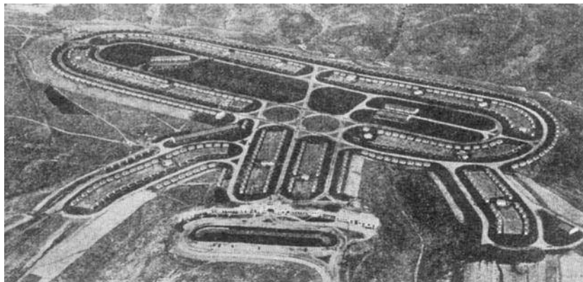
Los Angeles - Aerial view of the Olympic Village

athletes and their companions. As they all said, it was "unbearable."