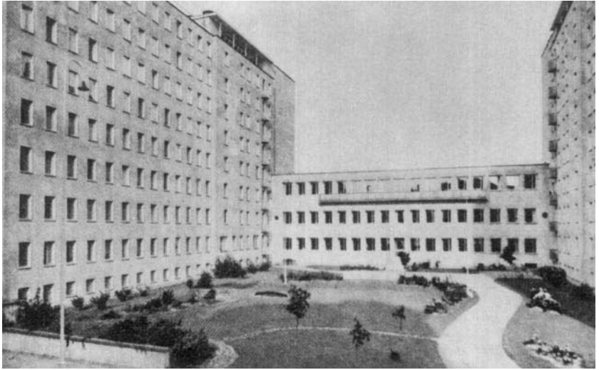
Helsinki - Village for the women athletes

In 1952, in Helsinki, the Village had to adapt to the disastrous consequences of the war: to accommodate the athletes, and after the Games, to provide lodging for those who needed it.