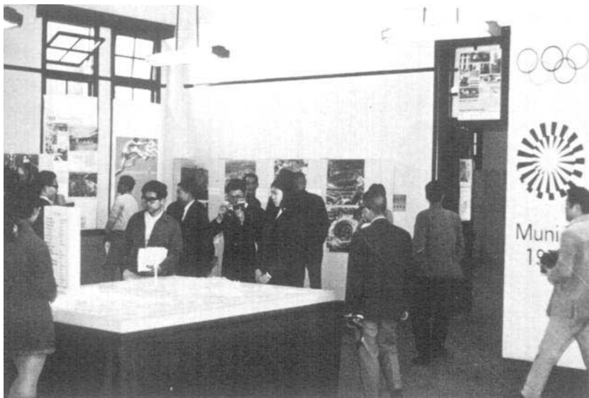
General view of the Exhibition.

This exhibition, spread through four rooms, "was a great success. Its principal theme: Munich, was illustrated by a 1/1000 scale model of the sports installations, photographs of the work in hand and posters published to commemorate the Games of the XXth Olympiad. A cinema room, where films of Munich and the German athletes in training were shown, completed the exhibition. Finally, a hundred photographs and various documents retraced the history of the Olympic Games of the modern era, from Athens to Mexico.