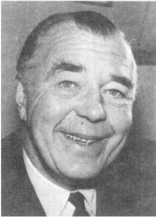
Prince Bertil, President of the Swedish Olympic Committee.