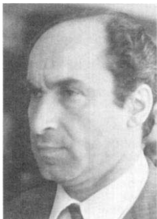
Mr Mohamed Mzali, President of the Comité olympique tunisien.

Mr Mohamed Mzali, IOC Member for Tunisia and President of the Tunisian Olympic Committee, has forwarded to us the following information, for which we thank him: