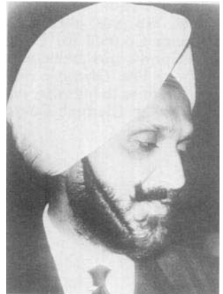
Raja Bhalindra Singh, President of the India Olympic Association.