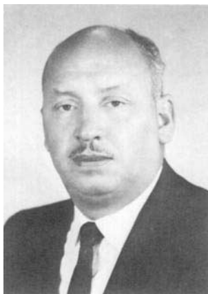
General José de J. Clark F. Mexico, dead 1971.

honour of staging the Games of the XIXth Olympiad.