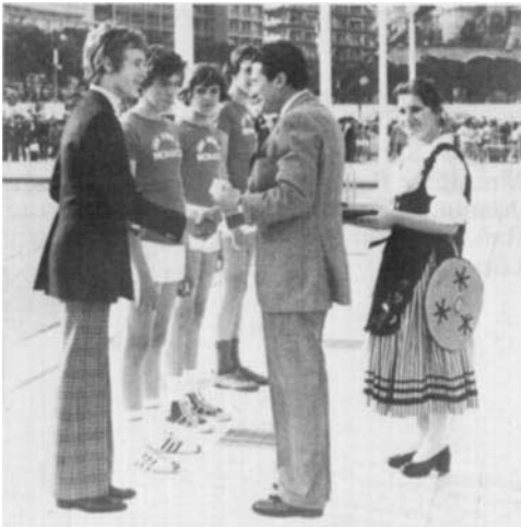
Comte Jean de Beaumont, Vice-President of the IOC, gives H. R. H. Prince Albert of Monaco the Monaco Olympic Committee's bronze medal.

The official medal award ceremony took place at the end of the day at the Olympic swimming pool in a setting worthy of this event.