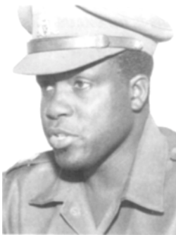
Lt.-Col. Paul K. Nkegbe, President.

● New officers of the Ghana Olympic and Commonwealth Games Committee :