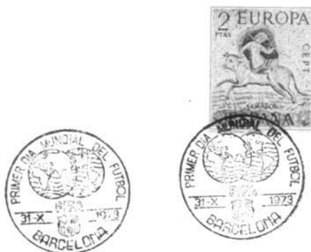
Reproduction of the first day envelope and card issued on 31st October 1973 at Barcelona on the occasion of the "First World Football Day".