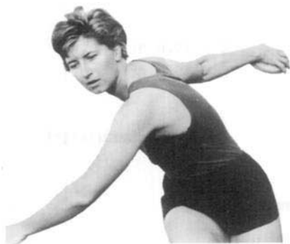
1968 - Lia Manoliu