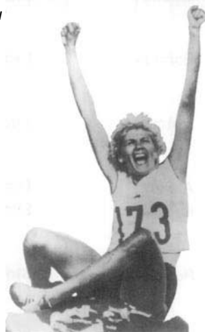
1960 and 1964 - Iolanda Balas