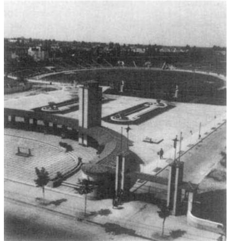
The Dynamo stadium in Bucarest.

108 sports schools (with activity outside school courses).