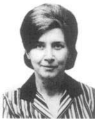
Mrs. Lia Manoliu