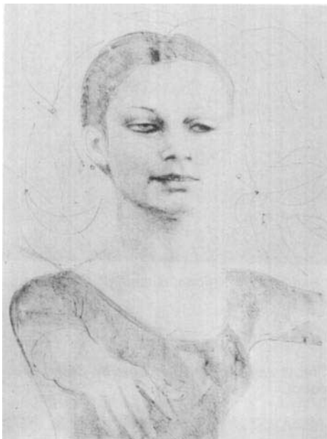
"Gymnast" by Ugo Attardi