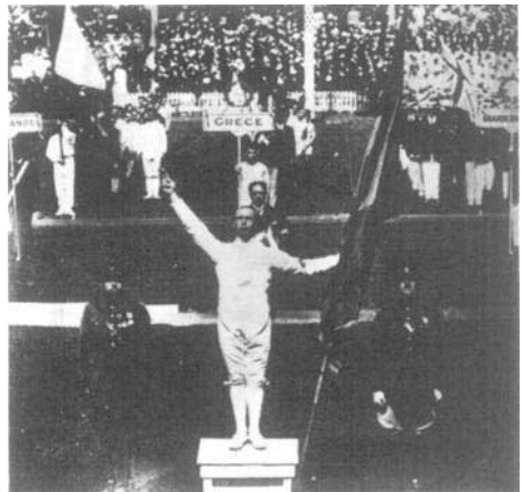
1920 - Antwerp