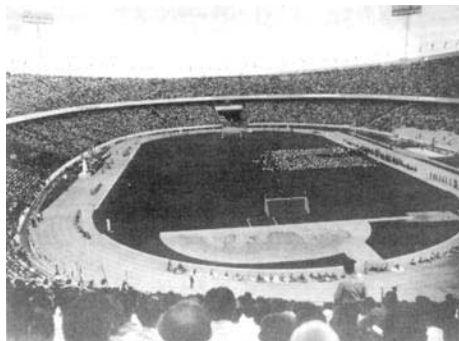
The Aryamehr stadium.