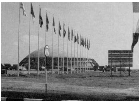
The sports palace in Tunis

First President of the Tunisian Olympic Committee from 1957 to 1960. Born in Tunis on 13th February 1912. Administrator, former Secretary General of the Tunisian Officials' Federation, former President of the Tunisian Boxing Federation, he became President of the TOC from its creation and was responsible for Tunisia's first participation in the Olympic Games in 1960.