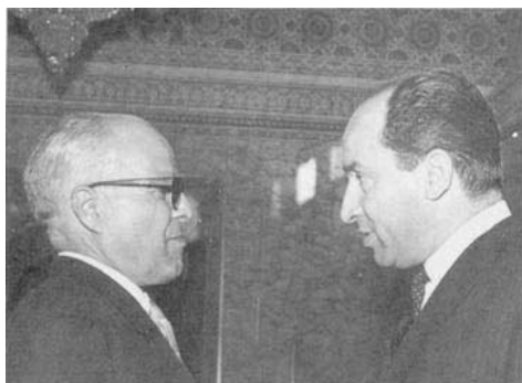
Mr. Habib Bourguiba, President of the Tunisian Republic, talking to Mr. Mohamed Mzali (right).