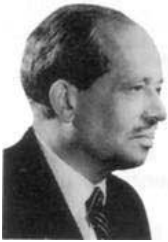
HSH Prince Regnant Franz-Joseph II