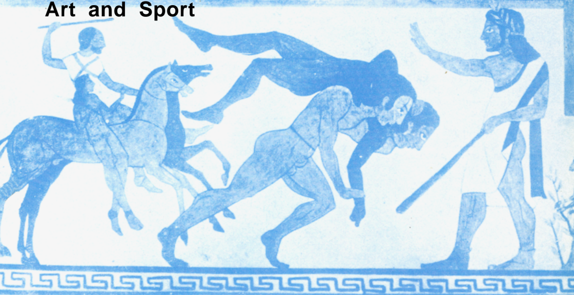
Wrestling scene in Etruscan painting (6th and 5th century B C).