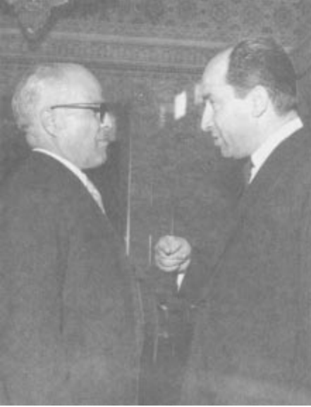
The President of the Tunisian Republic in conversation with Mr. Mohamed Mzali (right).

An African land wonderfully situated at the heart of the Mediterranean, an ancient country full of history and civilisation but a young nation devoting itself to reviving its secular heritage with spirit and soul, to taking on modernness, to mastering the present and preparing the future, Tunisia is proud and honoured to welcome the Executive Board of the International Olympic Committee which is meeting for the first time in Tunis, its capital. The presence among us of Lord Killanin, President of the IOC, and all my colleagues on the Executive Board, not only flatters our country's legendary hospitality but also, and in particular, its indestructible attachment to the great Olympic principles as set forth and redefined by Pierre de Coubertin, the renovator of the Olympic Games of the modern era.