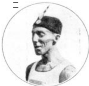
1924 and 1928 - Leon. Stukelj