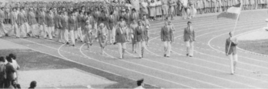
1976 - Montreal : the Yugoslav delegation

This delegation composed of two athletes was completely Serbian. The first Yugoslav delegation to take part in an Olympiad appeared at the 1920 Games in Antwerp.