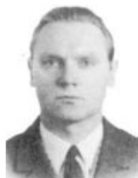
by Nikolai Kurdjukov, former Secretary General of the USSR NOC

Athletes practise sports under the instruction of 52,100 skilled trainers, 125,500