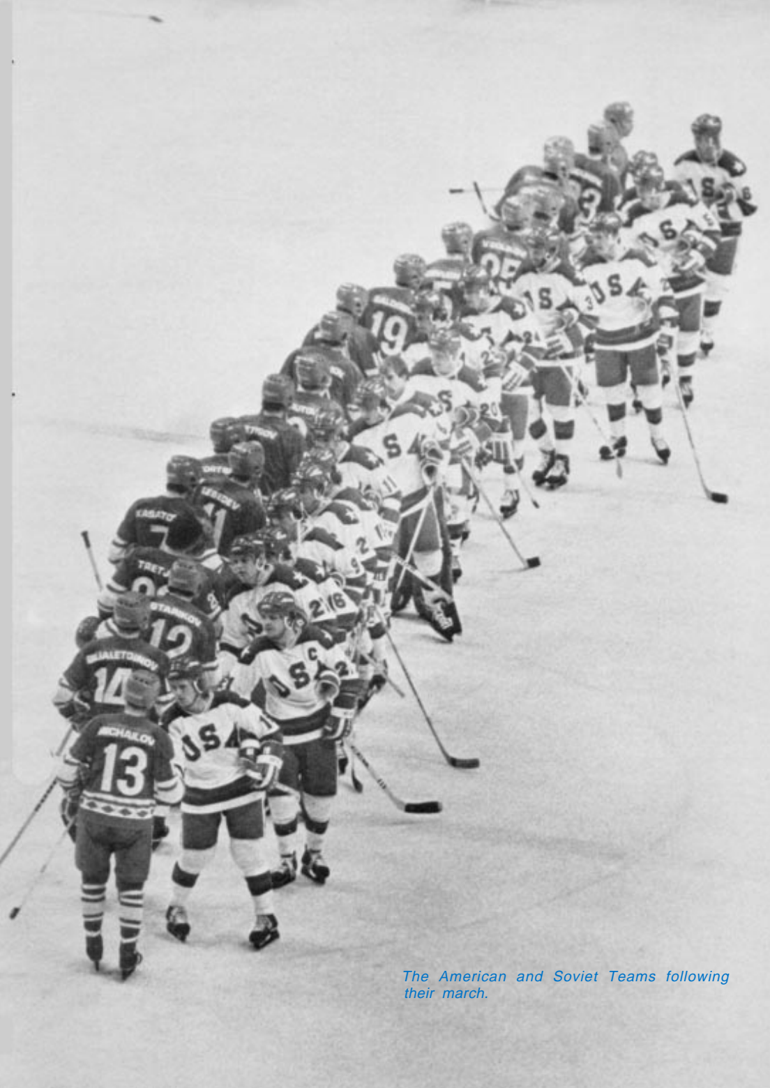
The American and Soviet Teams following their march.