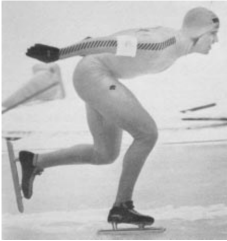
Eric Heiden (USA).