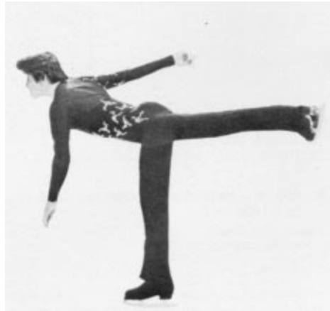
Robin Cousins (GBR).