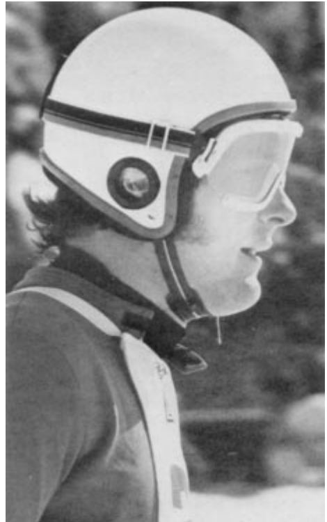
Ulrich Wehling (GDR).