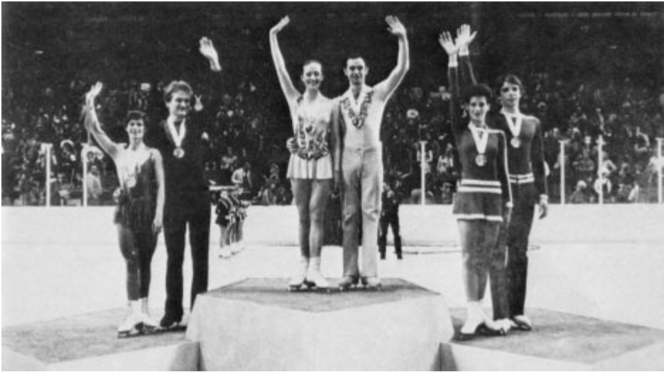
From left, Kristina Regoeczy - Andreas Sallay (HUN), Natalia Linichuk - Gennadi Karponosov (URS), Irina Moiseeva - Andrei Minenkov (URS).