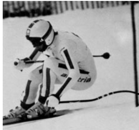
Annemarie Moser-Proell (AUT).