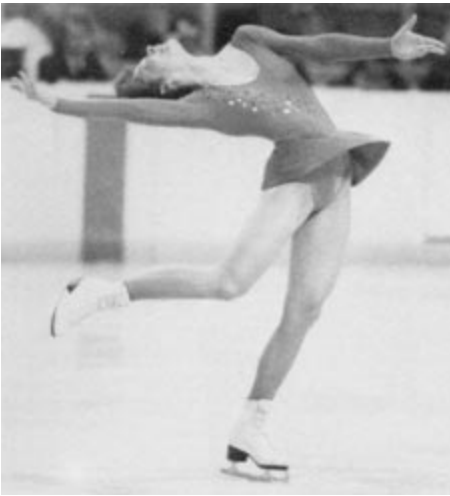
Anett Poetzsch (GDR).