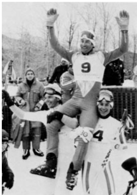
From left, Andreas Wenzel (LIE), Ingemar Stenmark (SWE) and Hans Enn (AUT).