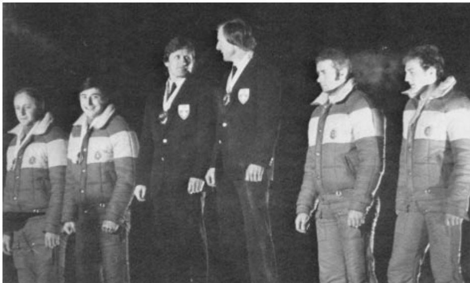
From left, Bernhard Germeshausen - Hans Jurgen Gerhardt (GDR), Erich Schaeerer - Josef Benz (SUI), Meinhard Nehmer - Bosdan Musiol (GDR).