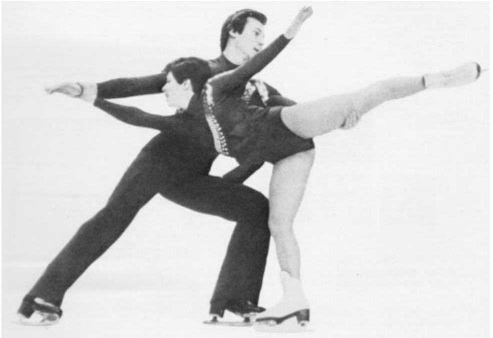
Irina Rodnina - Alexander Zaitsev (URS).