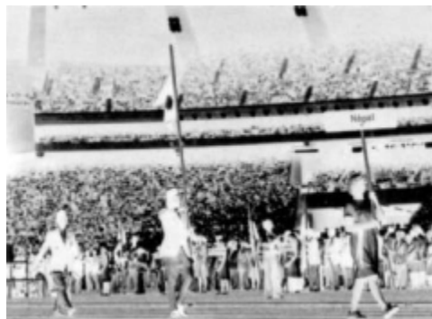
Montreal 1976 : the Nepal delegation.