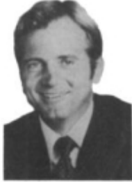
Peter V. Ueberroth