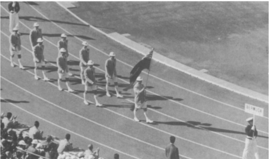
1964 - Tokyo : The Bermudian delegation.

Bermudian athletes have taken part in each e edition of the Olympic Games held since the inception of the BOA (except in 1980). None of the nation's athlete has yet participated in the Winter Games.