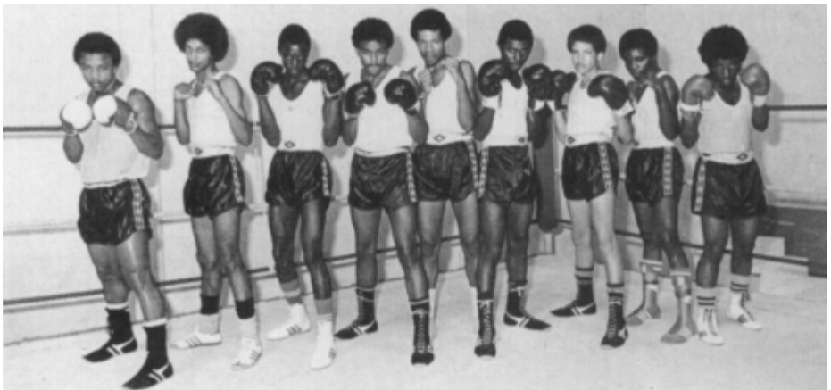
The best boxers of 1979.