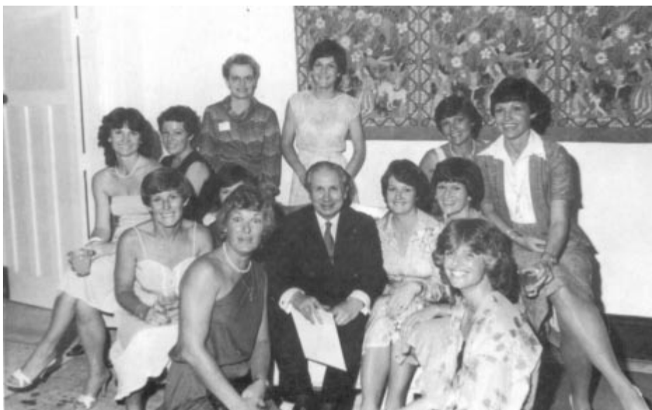
Mr. Juan Antonio Samaranch, President of the IOC, with the women's field hockey team which won the gold medal at the Games of the XXII Olympiad in Moscow.