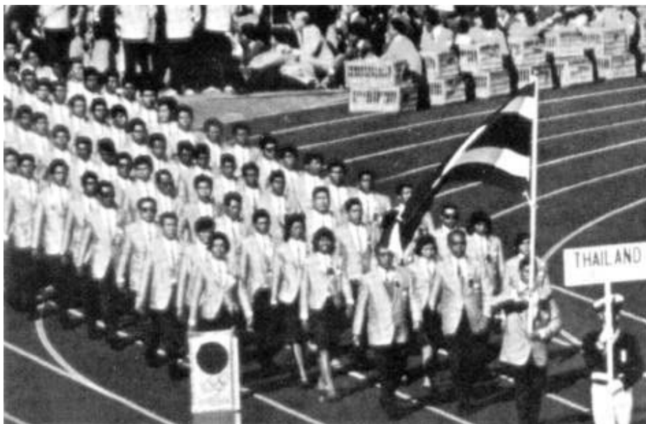
1964 - Tokyo : the Thai delegation.