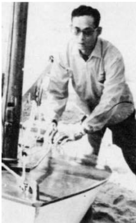
1970 - Bangkok: HM the King of Thailand at the Yachting regattas.

1970, to the Organising Committee of the Asian Games in Bangkok.