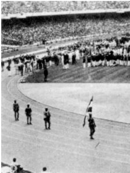
1968 - The delegation from Sierra Leone in Mexico.

In 1980, in Moscow, the SLOOGC's delegation was made up of 12 athletes (including 2 women) and 2 boxers.