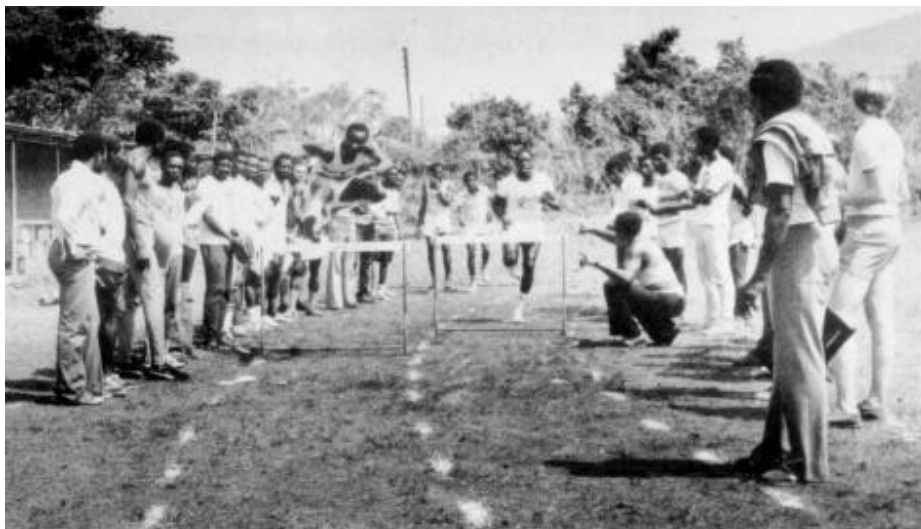
"Olympic Solidarity" athletics course in Sierra Leone.