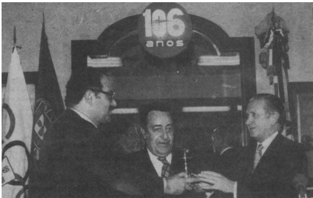
In Lisbon, the President of the IOC (at right) presenting the cup to the representative of the "Gimnasio Clube Portugues".