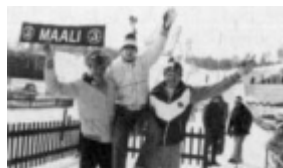
Urheilun vuosikirja 1980-81

Covering the results of all the competitions of the Olympic Games from 1896 in Athens to 1980 in Moscow, this book differs from a statistical yearbook in that it gives various information on the lives of the principal athletes.