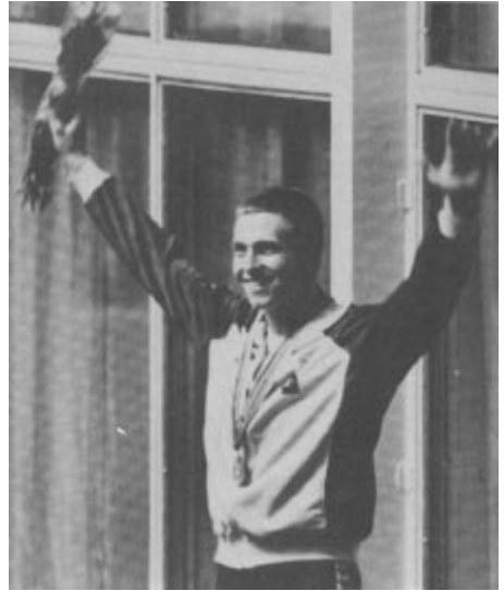
Vladimir Salnikov in Moscow, 1982.

Freestyle relay : 4 x 100 metres and 4 x 200 metres.