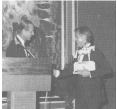
H.R.H. Prince Philip, Duke of Edinburgh. presents the President's Cup 1981 in Vienna to rider Alwin Schockemöhle. holder of the 1976 Olympic Gold Medal for showjumping and member of the West German team, winner of this trophy.