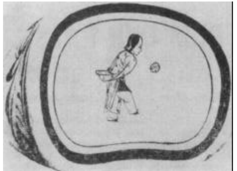
This young girl kicking a ball is painted on a porcelain pillow of the Song Dynasty (960-1279).