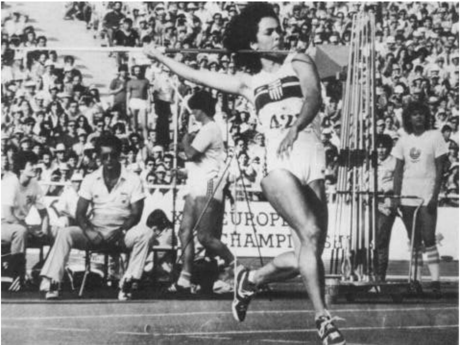
Sofia Sacorofa during the last European Championships in Athens.

Since the age of fifteen, when she came first in the national championships with a throw of 41.32 m., she has kept her title, improving her results every year until she won the world title with a throw of 74.20 m on 26th September 1982 in Chanéa, Crete (GRE). This victory occurred 16 days after that of Anna Verouli who had come first in the European Athletics Championships in Athens with a throw of 70.02 m.