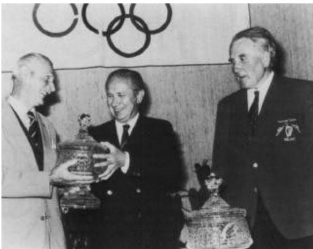
H.E. Mr. Juan Antonio Samaranch with Bob Tisdall (left) and Dr. Pat O'Callaghan.

• Bob Tisdall , Olympic 400 m hurdles champion in Los Angeles in 1932 and Dr. Pat O. Callaghan , Olympic hammer throwing champion in Amsterdam in 1928 and also in 1932, received a magnificent cut crystal cup from the hands of the guest of honour, H.E. Mr. Juan Antonio Samaranch, President of the IOC. Over 400 guests attended this banquet organised by the Olympic Council of Ireland to celebrate the jubilee of these two Olympic champions of the Games of the Xth Olympiad in Los Angeles in 1932.