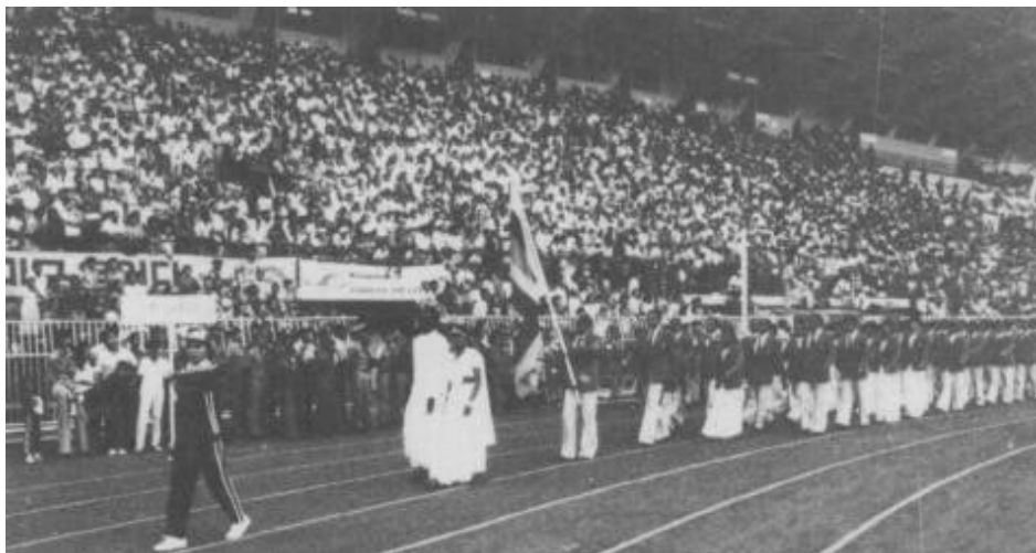
The delegation from Sri Lanka at the Asian Games in 1978.