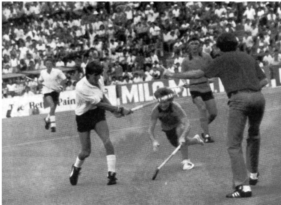
The Tun Razak Stadium in Kuala Lumpur also held the 1982 Junior World Cup.