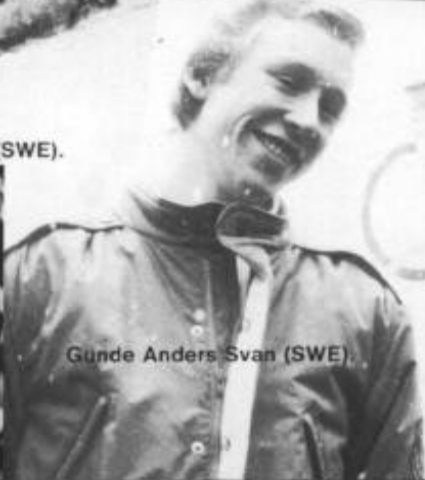
Gunde Anders Svan (SWE).