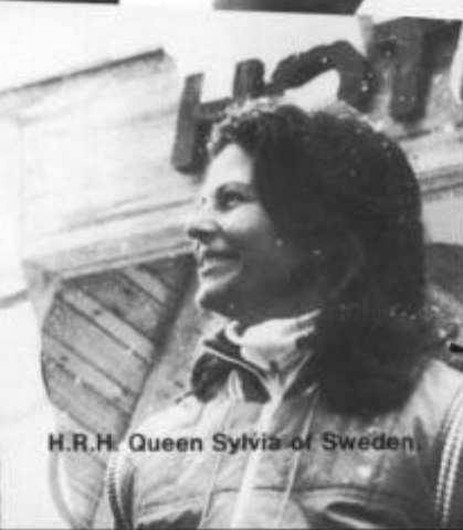
H.R.H. Queen Sylvia of Sweden.