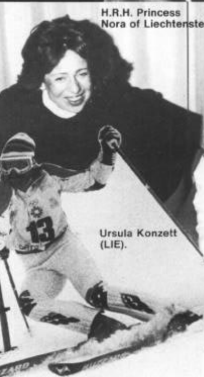
H.R.H. Princess Nora of Liechtenstein.