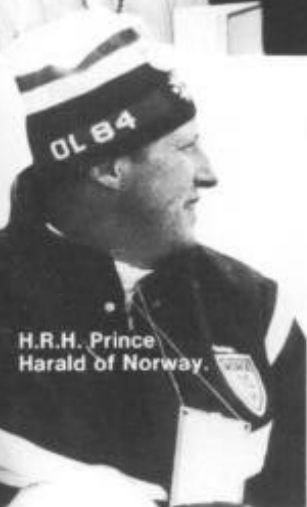
H.R.H. Prince Harald of Norway.