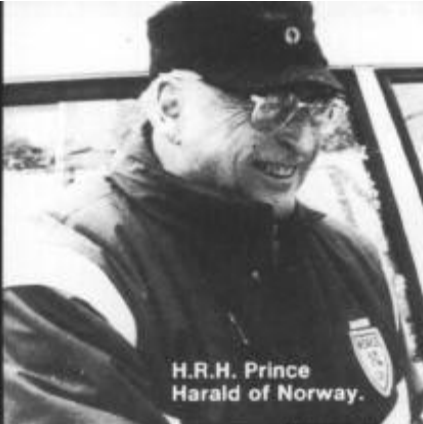
H.R.H. Prince Harald of Norway.