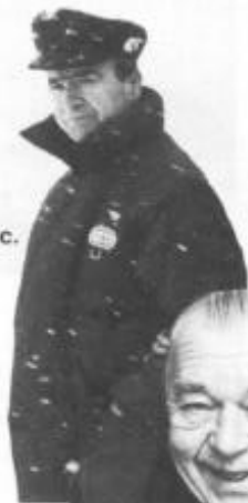
Mr. Branko Mikulic.