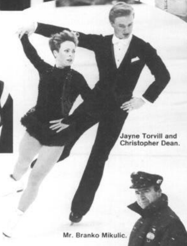
Jayne Torvill and Christopher Dean.