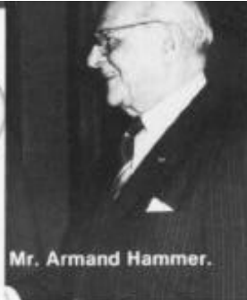
Mr. Armand Hammer.