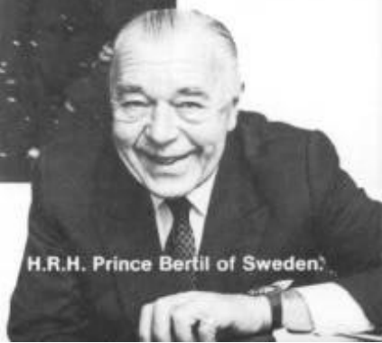
H.R.H. Prince Bertil of Sweden.