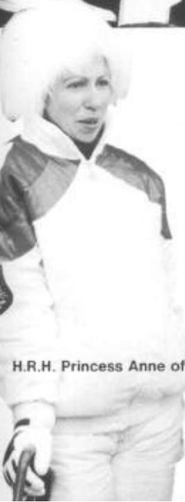
H.R.H. Princess Anne of England.