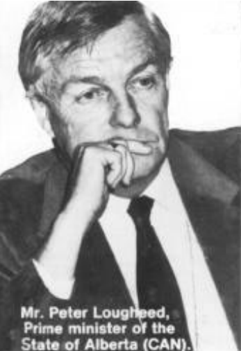
Mr. Peter Lougheed, Prime minister of the State of Alberta (CAN).