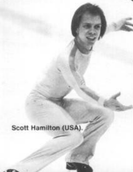
Scott Hamilton (USA).