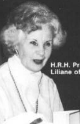
H.R.H. Princess Lillane of Sweden.