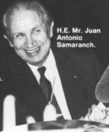
H.E. Mr. Juan Antonio Samaranch.