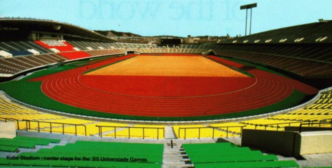
Kobe Stadium - center stage for the '85 Universiade Games.

The main stadium will be in the spotlight, and Mizuno will be in the wings, supporting the finest athletes and officials of this on going drama of speed and skill with the finest equipment.