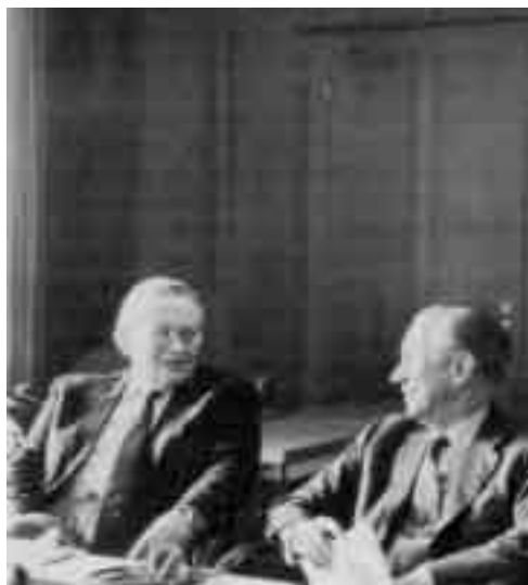
President Samaranch and Mr. Willi Daume, after the latter's presentation of the report of the Eligibility Commission.

This athlete's code is expected to be submitted for approval to one of the forthcoming IOC sessions, perhaps as soon as the 91st Session to be held in Lausanne in October 1986. At the present time, the draft is being studied by the National Olympic Committees, and the great majority of their reactions so far have been positive.