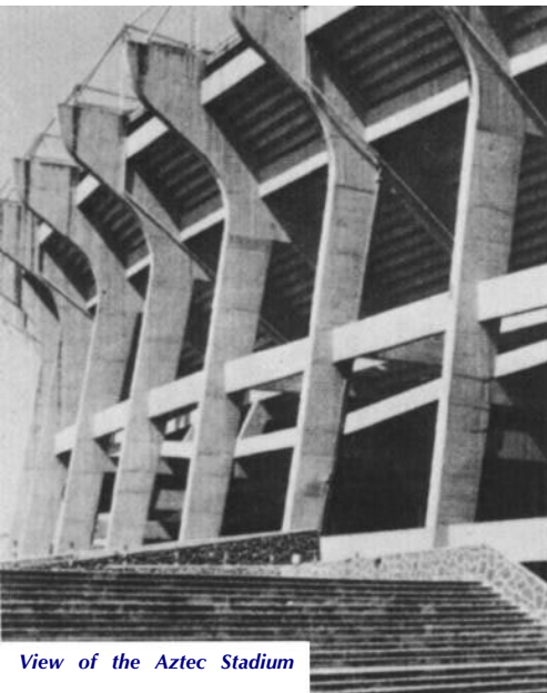
View of the Aztec Stadium

In keeping with his desire to serve, Pedro Ramírez Vázquez is also a great defender of the Olympic ideals, for he is conscious of their importance for mankind. As President of the Organising Committee for the Games of the XIXth Olympiad, he employed all his talent and dedication in the preparation of Games which