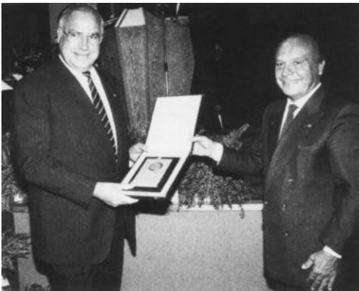
At the opening, of the IAAF Congress in Stuttgart, Mr. Primo Nebiolo, IAAF President, President the Chancellor of the Federal Republic of Germany, Mr. Helmut Kohl, with a commemorative medal.