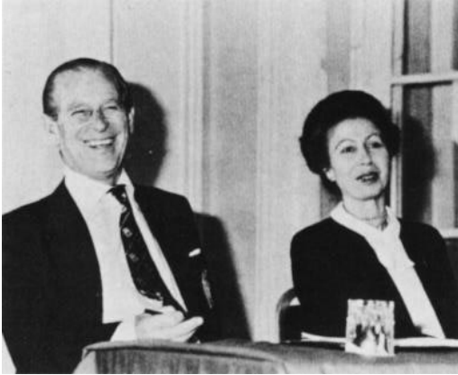
Father and daughter: the outgoing FEI President and his successor.