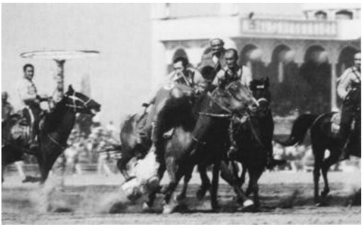
Goat snatching, a team game popular in Xinjiang, the object of which is to gain, by snatching, and keep possession of a goat carcass and eventually place it in one of two raised baskets located at opposite ends of the field.