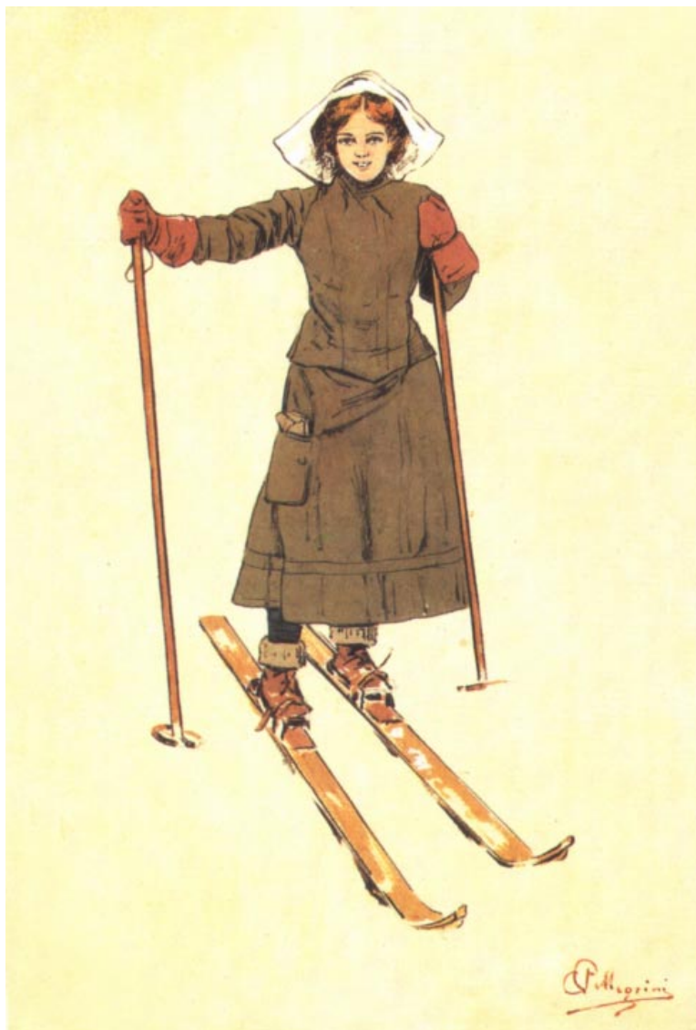
Skiing at the turn of the century, when winter sports were coming into their own — an exhibition devoted to poster-artist Carlo Pellegrini at the Olympic Museum in Lausanne.