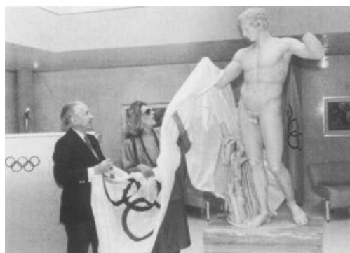
The IOC President and Mrs. Mercouri unveiling the Greek statue