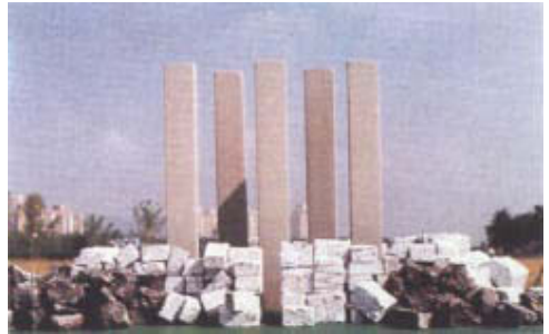
Seoul-XXIVth Olympiad, by the Greek Diohandi.

The Olympiad of the arts is being organized by a committee made up of various international and Korean experts and leading figures. All the participants at the two symposia have been chosen by the committee members : Messrs. Gerard Xuringuera (FRA), Pierre Restany (FRA), Ante Glibota (YUG), Thomas Messer (USA) and Usaka Nakabara (JPN). The artists invited to the first workshop came from Algeria, Bulgaria, Cuba, Czechoslovakia, Greece, Hungary, Israel, Italy, the Netherlands, Peru, Rumania, the USSR, Spain, Sweden and Yugoslavia, and they were