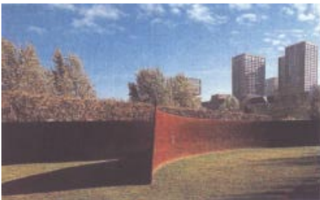
Work of the American Richard Serra.