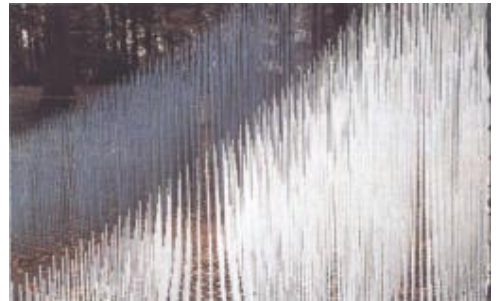
Work by the Venezuelan Soto.