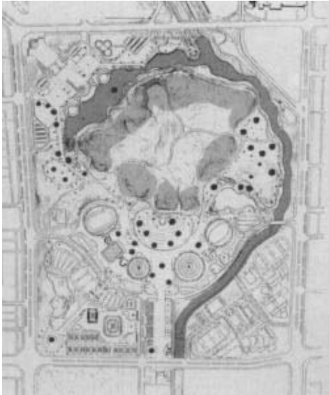
The location of the sculptures in the Olympic Park.

joined by two Korean artists. The second one will see participants from Federal Republic of Germany, Argentina, Australia, Belgium, Brazil, Canada, Denmark, France, Great Britain, Japan, Mexico, Poland, Switzerland, USA, Venezuela and Korea. At an interview, Mr. Restany the creator of New Realism and well-known art critic, stressed that this new type of event will stand out for the originality in the way it is organised and for the quality of its participants. Two artistic trends emerge from the works created, on the one hand the pursuit of the classical decorative tradition, on the other the creation of ideological and abstract works. But the most important thing, he explained, is that the inspiration should derive from the place where the work is created. Most of the artists gained strong impressions from Seoul, and inspiration developed gradually as the days went by.