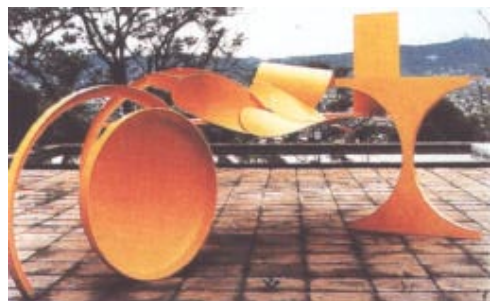
Anthony Caro from Britain.