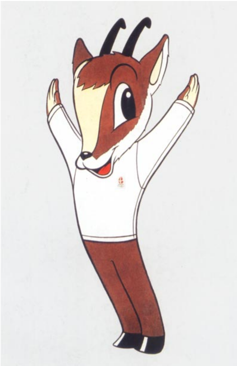
"OLYMPIC SAVOIE 92, THE PEAK OF PERFORMANCE"