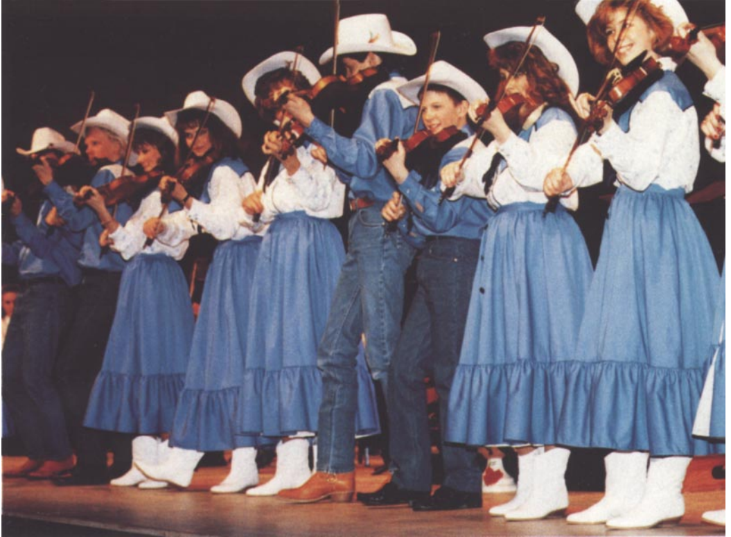
The Calgary Fiddlers in action.