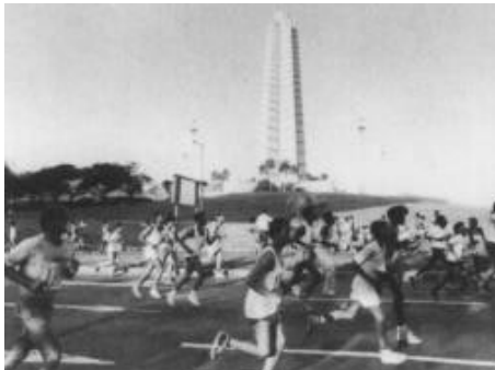
November marathon on the streets of Havana.

"Grandparents Circles" are another dynamic initiative. These are health groups for senior citizens, supervised by coaches and doctors, which encourage continuing sporting activity. Nearly fifty thousand participants last year proved that sport is not just for the lower end of the age spectrum.