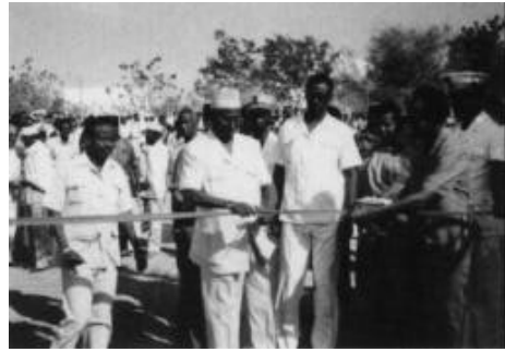
The inauguration of the Ali Sabieh Stadium in Djibouti.