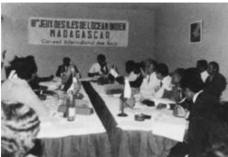
Council meeting in Antananarivo.