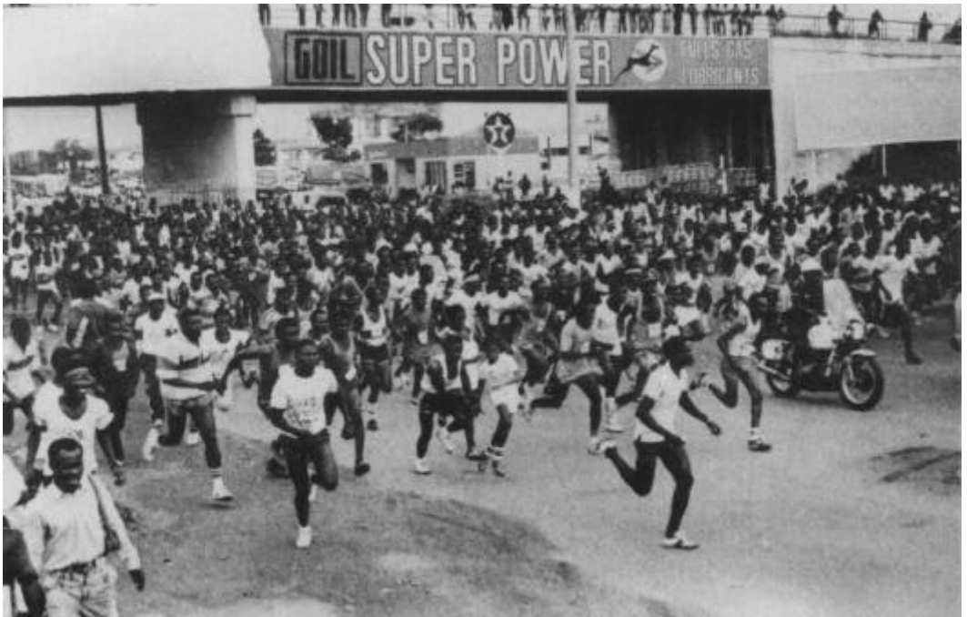
Popular start for the Olympic Day Run in Ghana.