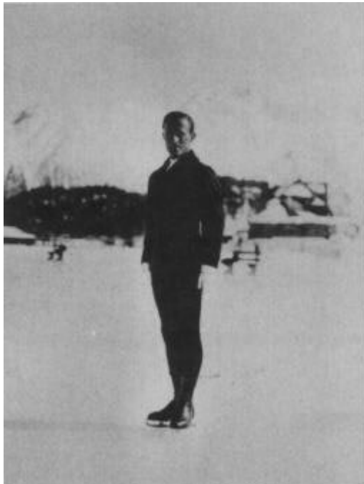
Cold for Gillis Grafstroem (SWE) on the ice in St. Moritz in 1928.